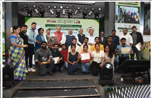
Valedictory and award presentation function 47 th Series poster presentation and exhibition and student participation in the two-day event held at Sharnbasva University, Kalaburagi