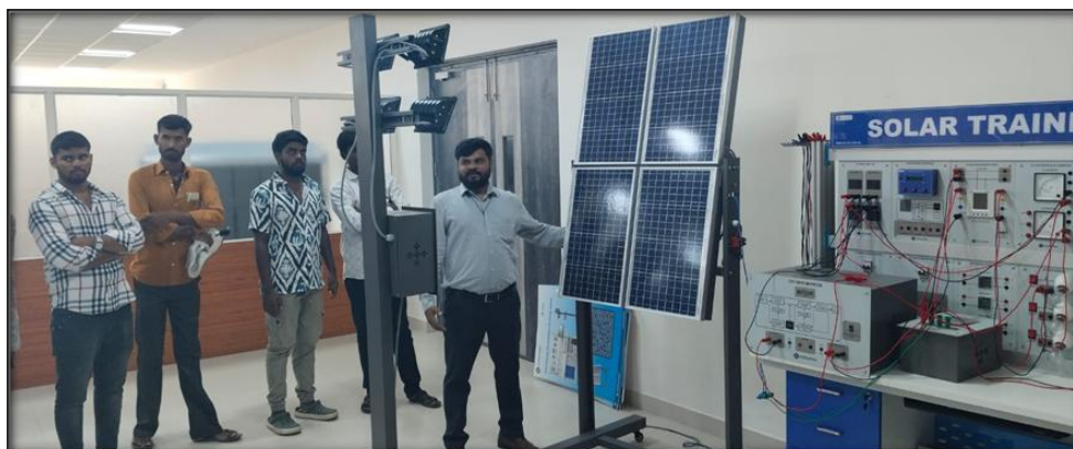
View of participants during training program on the solar plant at the IISc Challakere Campus, where a resource person is explaining solar panel installation